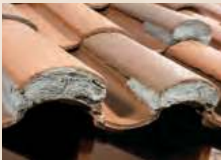
Close-Up of Boosted Eave