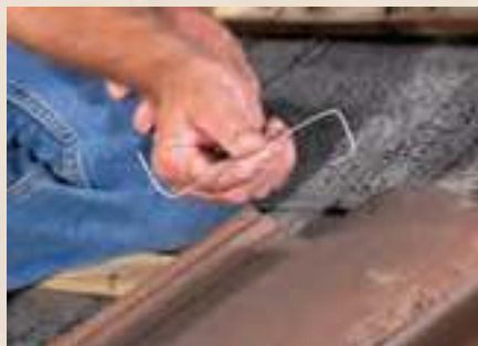
Boosted Wind Clips Included (Bronze & Stainless Steel)

Capistrano & Boosted Capistrano 3520 & 9520 Weathered Terracotta Flashed 30% Boosted Application