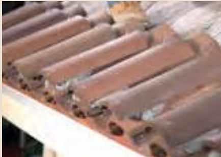
Boosting The Eave